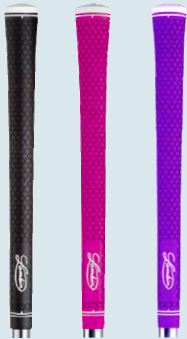
R.E.L. with 3GEN Undersize Black RL204 0.580 round 44 g R.E.L. with 3GEN Undersize Neon Pink RL205 0.580 round 43 g R.E.L. with 3GEN Undersize Neon Purple RL206 0.580 round 43 g

The classic design of the Crossline grip joins forces with the innovative ACE 3GEN compound to deliver a softer and tackier high-traction grip.