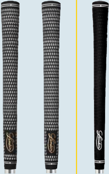
Crossline Midsize Jumbo (+1/16") RL17 0.580 round 63 g

Lamkin's most popular grip. The pattern is recognizable. The performance is unmistakable. The proprietary M2 rubber compound adds tack and reduces stress while the distinctive pattern reduces torque and increases hand traction for the ultimate performance grip. Reformulated materials and softer composition offer tour performance that's easier on the hand.