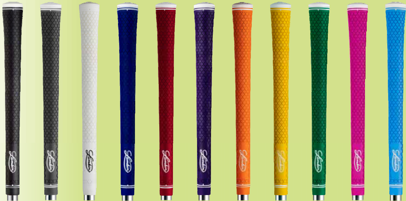
R.E.L. with 3GEN Standard Black RL169 0.600 round 52 g R.E.L. with 3GEN Standard Gray RL195 0.600 round 52 g R.E.L. with 3GEN Standard White RL196 0.600 round 56 g R.E.L. with 3GEN Standard Blue RL197 0.600 round 52 g R.E.L. with 3GEN Standard Red RL198 0.600 round 52 g R.E.L. with 3GEN Standard Purple RL199 0.600 round 52 g R.E.L. with 3GEN Standard Orange RL200 0.600 round 52 g R.E.L. with 3GEN Standard Yellow RL201 0.600 round 52 g R.E.L. with 3GEN Standard Green RL202 0.600 round 52 g R.E.L. with 3GEN Standard Pink RL232 0.600 round 52 g R.E.L. with 3GEN Standard Neon Blue RL203 0.600 round 52 g

The R.E.L. with 3GEN features Lamkin's proven functional and innovative 3GEN synthetic rubber compound that can help golfers improve control of their swings. The R.E.L. with 3GEN is Lamkin's latest premium grip for all woods and irons that combines this revolutionary material with a distinctive surface pattern. Both of these aspects together gracefully allow the golfer to apply very light grip pressure and gain more control of the club throughout the golf swing.