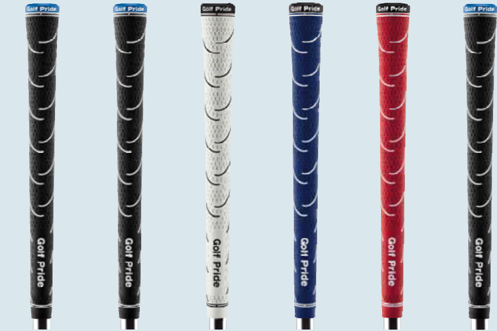
VDR Undersize Black RE148 0.580 round 45 g VDR Standard Black RE143 0.600 round 50 g VDR Standard White RE144 0.600 round 50 g VDR Standard Blue RE145 0.600 round 50 g VDR Standard Red RE146 0.600 round 50 g VDR Midsize Black RE147 0.600 round 57 g

VDR The VDR revolutionizes grip feel and performance with new triple-texture technology. Featuring three depths of surface grip texture, the VDR is specifically designed for heightened traction and excellent all-weather performance. The precision-cut, variable depth texture, combined with a shock-reducing rubber compound provides wrist protection from off-center strikes.