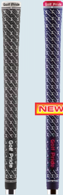
Z-Grip Cord Standard RE164 0.600 round 50 g Z-Grip Patriot Standard RE171 0.600 round 50 g