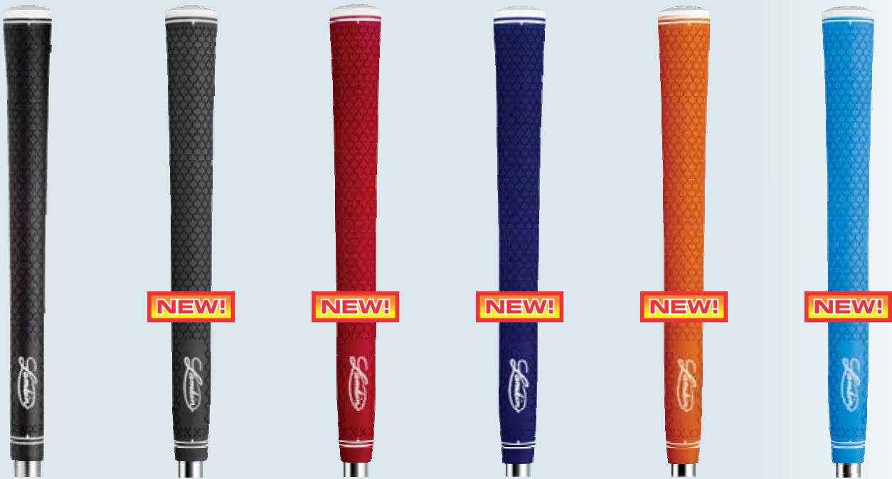
R.E.L. with 3GEN Midsize Black RL194 0.600 round 63 g R.E.L. with 3GEN Midsize Gray RL233 0.600 round 63 g R.E.L. with 3GEN Midsize Red RL234 0.600 round 63 g R.E.L. with 3GEN Midsize Blue RL235 0.600 round 63 g R.E.L. with 3GEN Midsize Orange RL236 0.600 round 63 g R.E.L. with 3GEN Midsize Neon Blue RL237 0.600 round 63 g