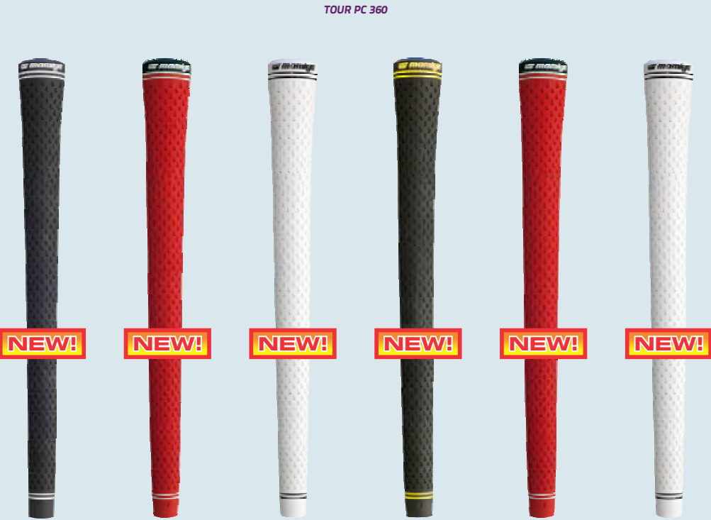
Tour PC 360 Black RU33 Tour PC 360 Red RU34 Tour PC 360 White RU35 Tour PC 360 Midsize Black RU36 Tour PC 360 Midsize Red RU37 Tour PC 360 Midsize White RU38 0.600 round 51 g 0.600 round 51 g 0.600 round 51 g 0.600 round 62 g 0.600 round 62 g 0.600 round 62 g

TOUR PC 360 The Tour PC 360 provides golfers with a soft feel and enhanced durability. Using a new proprietary blend of the finest natural and synthetic rubber compounds available, there is an additional 20% embossed texture provides exceptional traction in wet or dry conditions. Lack of logo on the body of the grip is ideal for clubs using adjustable adapter systems.