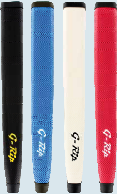
Jumbo Lite Black Jumbo Lite Blue Jumbo Lite White Jumbo Lite Red GRWPF-BK60 GRWPF-BL60 GRWPF-WH60 GRWPF-RE60 .600 Round 55g .600 Round 55g .600 Round 55g .600 Round 55g

Made from the same triple layer process as the standard size Wave, the BIG Wave offers an oversize option in this popular design. The Wave grips are tacky and soft on the surface, but firm to hold – allowing you to grip lightly without compromising traction.