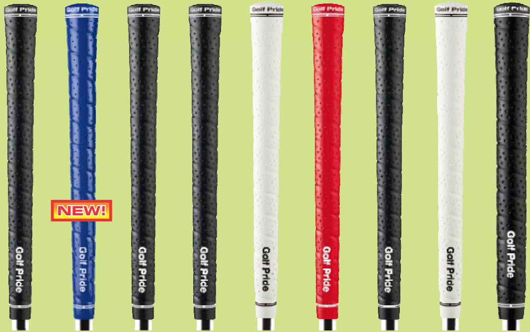
Tour Wrap 2G Undersize Black RE128 0.580 round 43 g Tour Wrap 2G Standard Blue RE172 0.580 round 50 g Tour Wrap 2G Standard Black 0.580 RE129 0.580 round 50 g Tour Wrap 2G Standard Black 0.600 RE130 0.600 round 48 g Tour Wrap 2G Standard White RE131 0.600 round 55 g Tour Wrap 2G Standard Red RE132 0.600 round 48 g Tour Wrap 2G Midsize Black RE133 0.600 round 58 g Tour Wrap 2G Midsize White RE165 0.600 round 66 g Tour Wrap 2G Jumbo Black RE134 0.600 round 73 g

TOUR WRAP 2G With a modernized look and fresh, new colors, the Tour Wrap 2G now features enhanced tackiness and an even softer material for a great new feel. This onepiece, simulated wrap grip combines the look and feel of luxury leather with the durability, economy, and performance of hightack rubber.