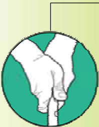
The hand placement buttons on the Lamkin Performance Plus Wedge Grip, located an inch and a half apart, are designed to enable more precise and repeatable hand placement, facilitating a consistent and guess-work free swing.

An enlarged grip profile with 3GEN to improve overall comfort and stability. Hands marry together in a unified grip and produce swings with a higher speed, more accuracy and less tension.