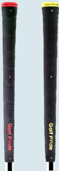
Dual Durometer Midsize RE74 0.600 round 49 g Dual Durometer Standard RE75 0.600 round 56 g