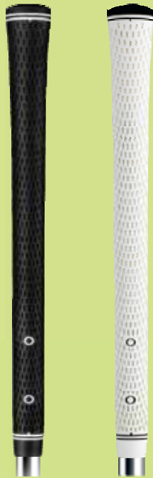
Performance Plus 3GEN Wedge Standard Black RL192 0.600 round 57 g