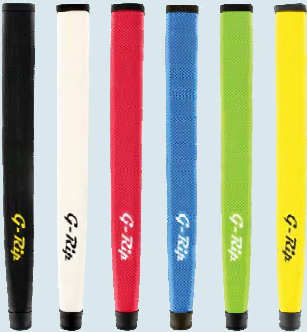
Oversize Black Oversize White Oversize Red Oversize Blue Oversize Green Oversize Yellow GRWPM-BK60 GRWPM-WH60 GRWPM-RE60 GRWPM-BL60 GRWPM-GR60 GRWPM-YE60 .600 Round 95g .600 Round 95g .600 Round 95g .600 Round 95g .600 Round 95g .600 Round 95g