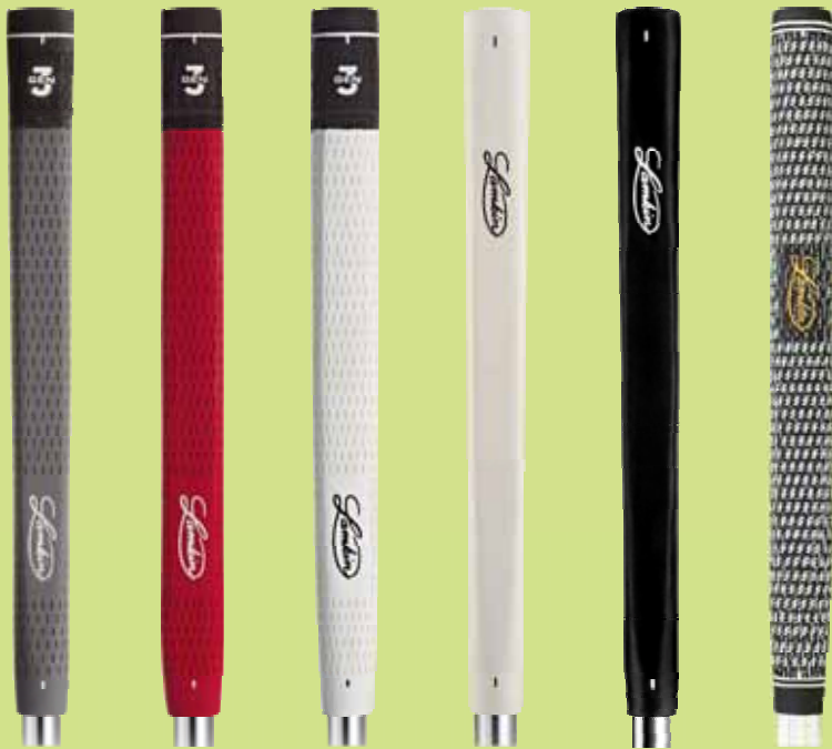
E.B.L. Pistol Putter Gray/Black with 3GEN E.B.L. Paddle Putter Red/Black with 3GEN E.B.L. Paddle Putter White/Black with 3GEN Midsize E.B.L. Smooth Pistol White with 3GEN E.B.L. Smooth Pistol Black with 3GEN Crossline Paddle Putter RL174 RL175 RL176 RL177 RL215 RL22 0.580 73 g 0.580 76 g 0.580 93 g 0.580 79 g 0.580 79 g 0.580 70 g

CROSSLINE PADDLE PUTTER GRIP The Crossline Paddle combines the paddle and pistol shapes. Thick around the back and flat on top to round at the end.