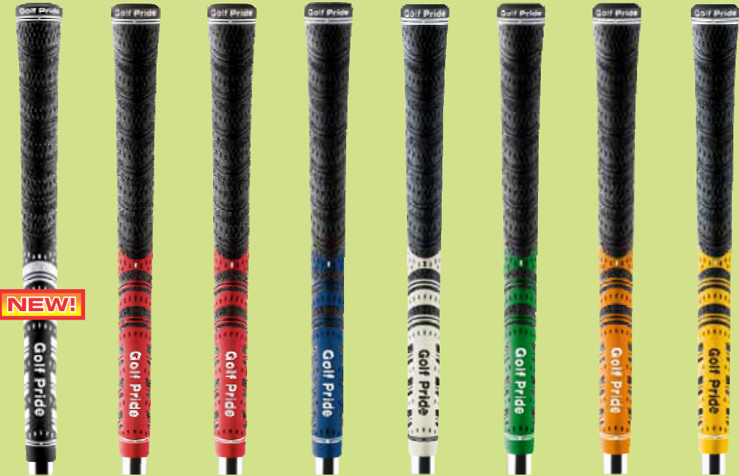
New Decade MCC Standard Black RE173 0.580 round 48.5 g New Decade MCC Standard Red 0.580 RE141 (round) RE137 (ribbed) 0.580 48.5 g New Decade MCC Standard 0.600 Red RE34 (round) RE138 (ribbed) 0.600 46.5 g New Decade MCC Standard Blue RE25 0.600 round 46.5 g New Decade MCC Standard White RE107 0.600 round 46.5 g New Decade MCC Standard Green RE26 0.600 round 46.5 g New Decade MCC Standard Orange RE27 0.600 round 46.5 g New Decade MCC Standard Yellow RE94 0.600 round 46.5 g

NEW DECADE MCC (MULTICOMPOUND) Golf Pride's most popular grip. This innovative hybrid grip fuses the positive performance of rubber and cord for an exciting new look and feel. The Multi-Compound boasts Golf Pride's exclusive black Velvet Cord in the upper hand area for firm all-weather control, and a soft rubber material in the lower area.