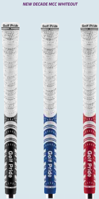
New Decade MCC Whiteout Standard White/Black RE158 0.600 round 49.5 g New Decade MCC Whiteout Standard White/Blue RE159 0.600 round 49.5 g New Decade MCC Whiteout Standard White/Red RE160 0.600 round 49.5 g

NEW DECADE MCC MIDSIZE Golf Pride's most popular grip in midsize for larger hands.