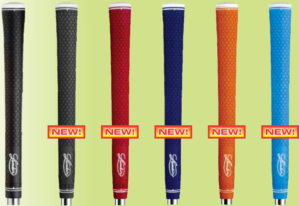
R.E.L. with 3GEN Oversize Black RL193 0.600 round 78 g R.E.L. with 3GEN Oversize Gray RL238 0.600 round 78 g R.E.L. with 3GEN Oversize Red RL239 0.600 round 78 g R.E.L. with 3GEN Oversize Blue RL240 0.600 round 78 g R.E.L. with 3GEN Oversize Orange RL241 0.600 round 78 g R.E.L. with 3GEN Oversize Neon Blue RL242 0.600 round 78 g