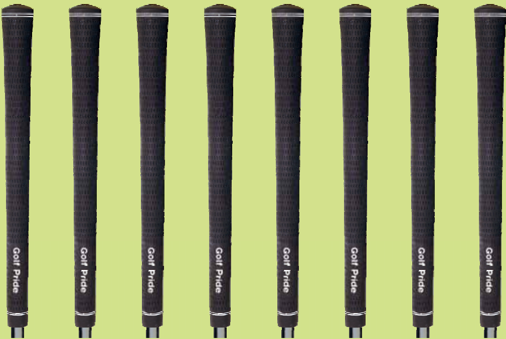
Tour Velvet Junior RE83 0.500 ribbed 45 g Tour Velvet Undersize 0.560 Ribbed RE60 0.560 ribbed 50 g Tour Velvet Undersize 0.580 Ribbed RE136 0.580 ribbed 47.5 g Tour Velvet Standard 0.580 RE42 (round) RE104 (ribbed) 0.580 51.5 g Tour Velvet Standard 0.600 RE72 (round) RE78 (ribbed) 0.600 49.5 g Tour Velvet Standard 0.620 RE155 0.620 round 45 g Tour Velvet Midsize (+1/16") RE43 0.600 round 53.5 g Tour Velvet Jumbo (+1/8") RE04 0.600 round 61 g

TOUR VELVET The most popular grip in golf today combines an exclusive, state-of-the-art rubber-blend compound with a computer-designed, nons-lip surface pattern for maximum playability, comfort, and confidence. The Tour Velvet is the standard upon which many club manufacturers base their designs.