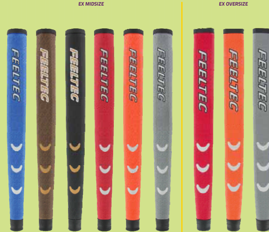
Midsize Blue Midsize Brown Midsize Black Midsize Red Midsize Orange Midsize Grey Oversize Red Oversize Orange Oversize Grey FEEXMP-BL FEEXMP-BR FEEXMP-BK FEEXMP-R FEEXMP-O FEEXMP-GY FEEXOP-R FEEXOP-O FEEXOP-GY .600 Round 80g .600 Round 80g .600 Round 80g .600 Round 80g .600 Round 80g .600 Round 80g .600 Round 95g .600 Round 95g .600 Round 95g

The chin and belly putters of the modern era deserve to be fitted with a stylish and modern looking grip. The G-Rip LONG Wave offers just that. At 21" long it will fit any long putter.