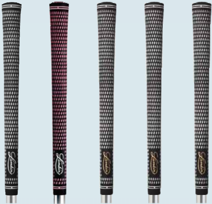
Crossline FS White Undersize RL209 0.580 round 44 g