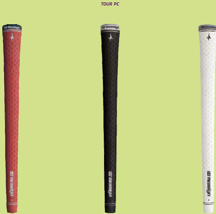
Tour PC Red Standard RU22 Tour PC Black Standard RU01 Tour PC White Standard RU10 0.600 round 55 g 0.600 round 51 g 0.600 round 55 g

TOUR PC Premium compound grips. These grips provide a velvet soft feel in an exceptionally torsionally tight, long lasting grip.