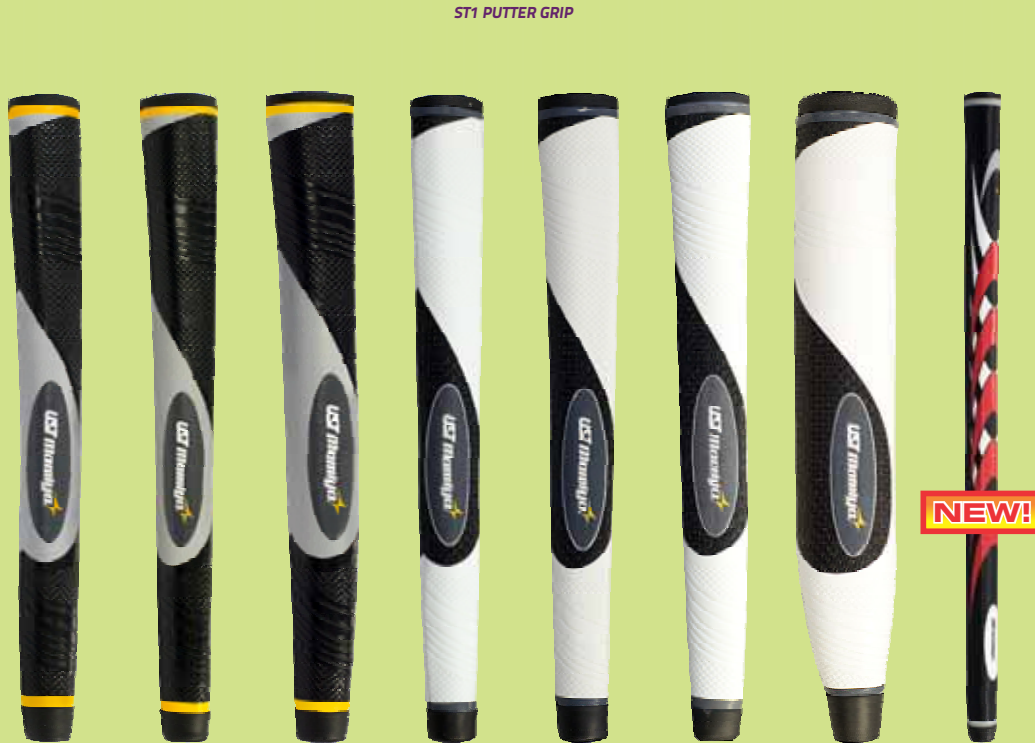
ST1 Putter Standard Black RU18 ST1 Putter Midsize Black RU19 ST1 Putter Jumbo Black RU20 ST1 Putter Standard White RU28 ST1 Putter Midsize White RU29 ST1 Putter Jumbo White RU30 ST1 Putter Super Jumbo White RU31 ST1 21" Belly Putter Grip RU32 0.600 60 g 0.600 76 g 0.600 99 g 0.600 60 g 0.600 76 g 0.600 99 g 0.600 82 g 0.600 146 g

ST1 BELLY PUTTERGRIP These soft, tacky grips have a uniquely distinct feel. The ST1 features an embossed pattern providing traction in strategic areas and enhanced control. ST1 belly putter grip is 21 inches long.