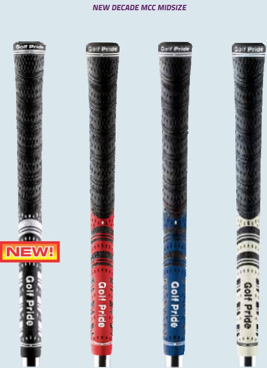
New Decade MCC Midsize Black RE174 0.600 round 59 g New Decade MCC Midsize Red RE31 0.600 round 59 g New Decade MCC Midsize Blue RE108 0.600 round 59 g New Decade MCC Midsize White RE126 0.600 round 59 g