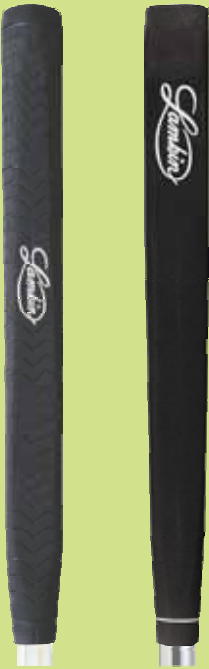
Deep Etched Paddle Putter Jumbo Putter RL20 RL09 0.580 77 g 0.580 112 g

JUMBO PUTTER GRIP This extra large putter grip is perfect for big hands or even arthritic hands.