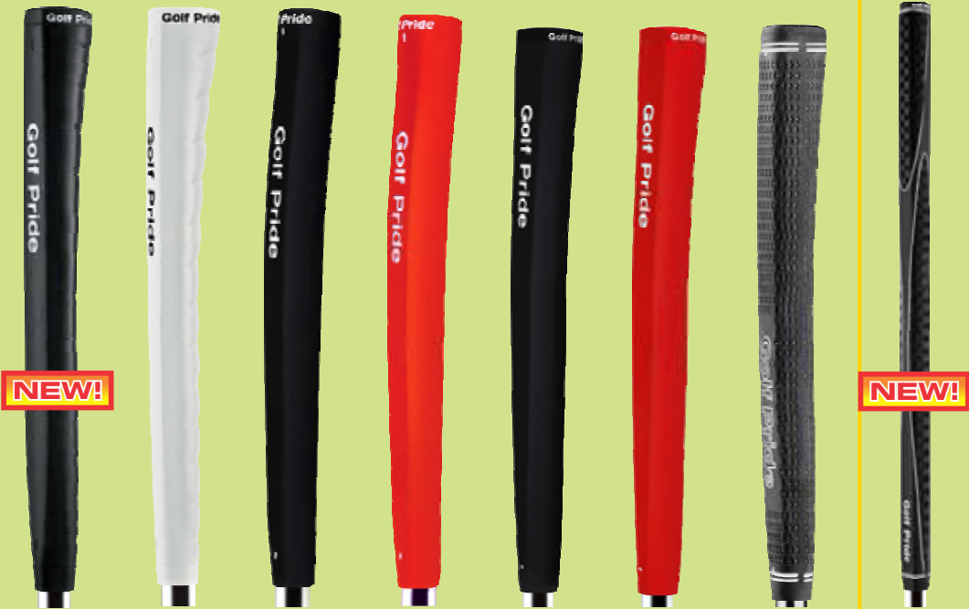
Player's Wrap Putter Black RE175 0.580 76 g Player's Wrap Putter RE149 0.580 76 g Tour Tradition Putter Black RE120 0.580 58 g Tour Tradition Putter Red RE122 0.580 58 g Tour Classic Putter Black RE124 0.580 84 g Tour Classic Putter Red RE125 0.580 84 g Velvet Pro Series Putter RE156 0.580 65 g B-140 Belly Putter RE176 0.620 142.5 g

GOLF PRIDE BELLY GRIP New from Golf Pride, the B-140 belly putter grip is manufactured with high-performance lightweight material, combined with a micro-texture, to give golfers increased feel on the greens. A 21-inch flat paddle construction allows players to utilize several gripping styles to produce a consistent roll. This unique design structure is optimized for easy installation.