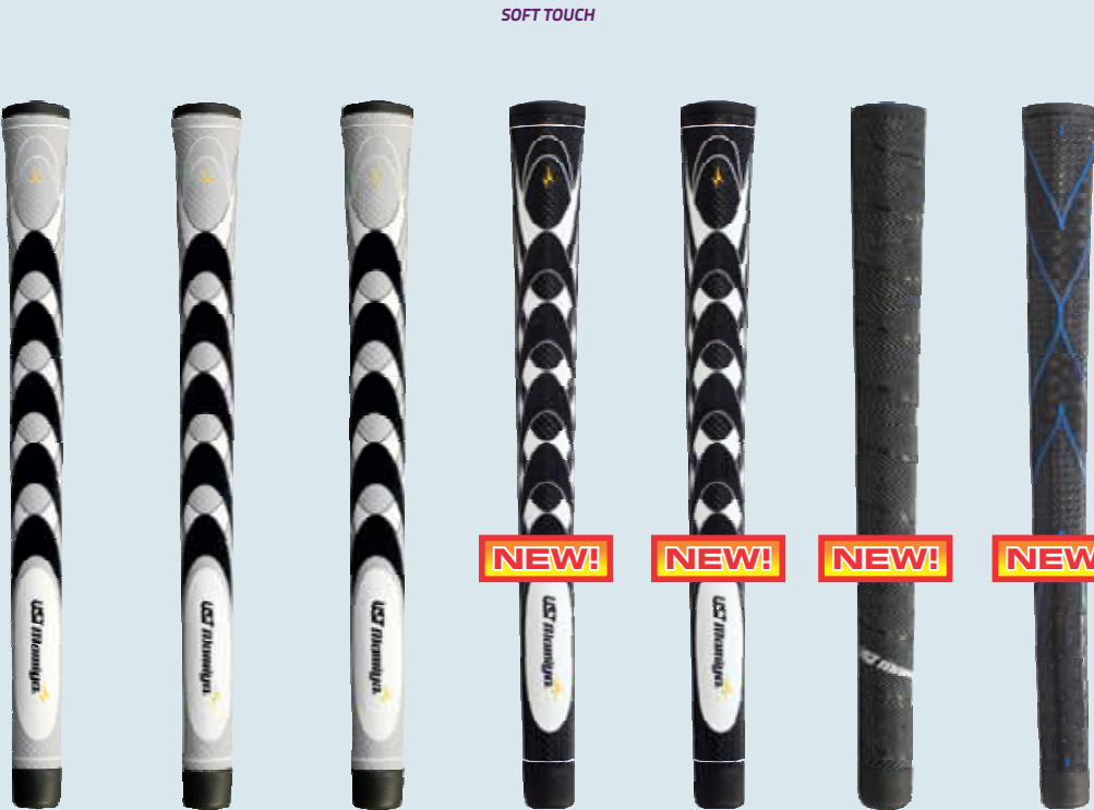
Soft Touch Undersize Gray RU23 Soft Touch Standard Gray RU24 Soft Touch Midsize Gray RU25 Soft Touch Standard Black RU39 Soft Touch Midsize Black RU40 Soft Touch Oversize Wrap RU41 Soft Touch Lite RU42 0.580 round 37 g 0.600 round 43 g 0.600 round 47 g 0.600 round 43 g 0.600 round 47 g 0.600 round 48 g 0.600 round 30 g

SOFT TOUCH GRAY Enhanced designs distribute a superior, relaxed feel while limiting shock through advanced technology and materials. Wet or dry, the Soft Touch White grips perform like a champion.