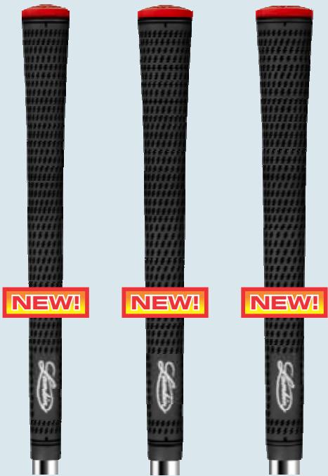
Crossline Ace 3GEN Standard Black RL229 0.580 round 52 g Crossline Ace 3GEN Midsize Black RL230 0.580 round 63 g Crossline Ace 3GEN Oversize Black RL231 0.580 round 78 g