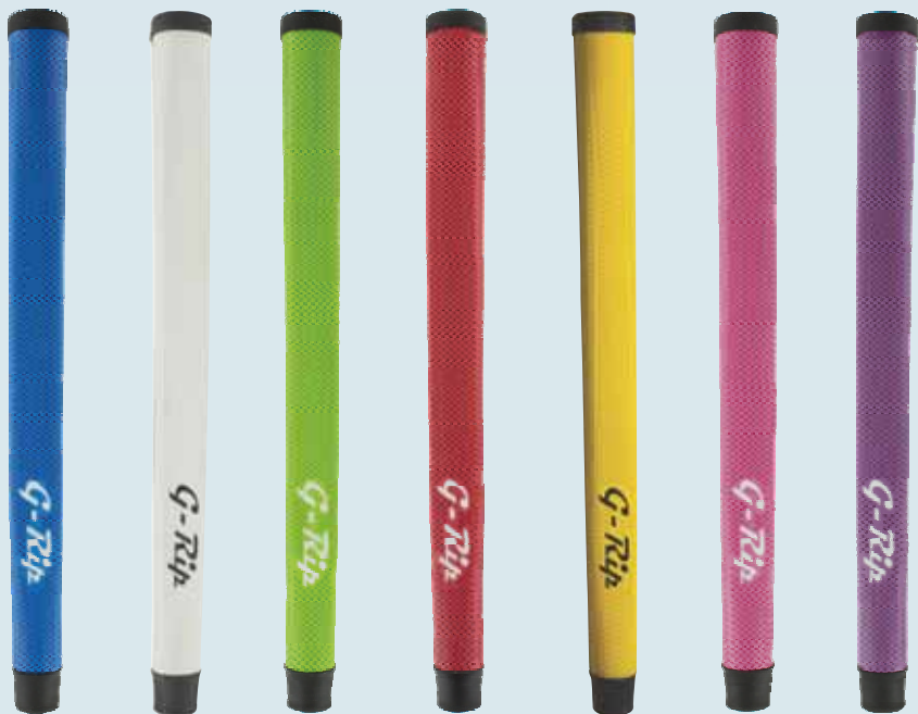
Standard Blue Standard White Standard Green Standard Red Standard Yellow Standard Pink Standard Purple GRFPBL60 GRFPWH60 GRFPGR60 GRFPRE60 GRFPYE60 GRFPPK60 GRFPPU60 .600 Round 66g .600 Round 66g .600 Round 66g .600 Round 66g .600 Round 66g .600 Round 66g .600 Round 66g

The new Wave putter grips from G-Rip offer a stylish look and feel. Soft & tacky on the surface but firm to hold, the Wave grips are great for feel and control. The top surface is designed with a water repellent compound making them perfect for use in any weather conditions.