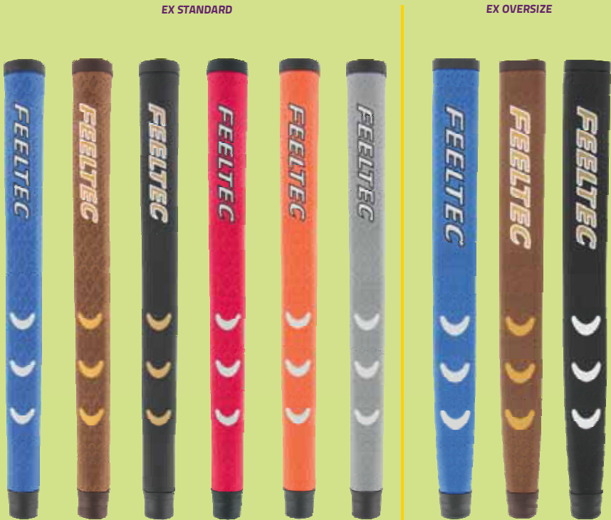
Standard Blue Standard Brown Standard Black Standard Red Standard Orange Standard Grey Oversize Blue Oversize Brown Oversize Black FEEXP-BL FEEXP-BR FEEXP-BK FEEXP-R FEEXP-O FEEXP-GY FEEXOP-BL FEEXOP-BR FEEXOP-BK .600 Round 65g .600 Round 65g .600 Round 65g .600 Round 65g .600 Round 65g .600 Round 65g .600 Round 95g .600 Round 95g .600 Round 95g

The EX Series by Feeltec is available in six colour options and 3 sizes. This represents a very versatile range with colours and sizes to suit a wide range of golfers needs.