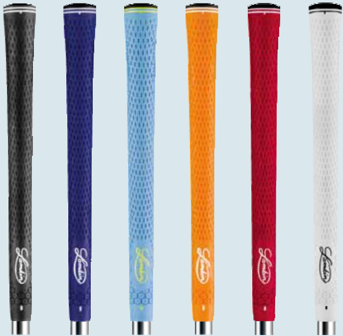
Standard Black Standard Dark Blue Standard Neon Blue Standard Orange Standard Red Standard White .580 Round LK16-BLK .580 Round LK16-BLU .580 Round LK16-N-BLU .580 Round LK16-ORG .580 Round LK16-RED .580 Round LK16-WHT 52g 52g 52g 52g 52g 56g

i6 3GEN Enjoy the confidence of cord without the cost of cord. i6 combines two distinct surface patterns to maximise traction and comfort. The underside of the grip features an aggressive hexagonal pattern to promote a slip free connection in any weather condition. The top side features a softer feeling keyhole design that improves contact tackiness with your palms without a rough feel through the shot.