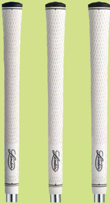
Performance Plus 3GEN Standard White RL172 0.580 round 53 g